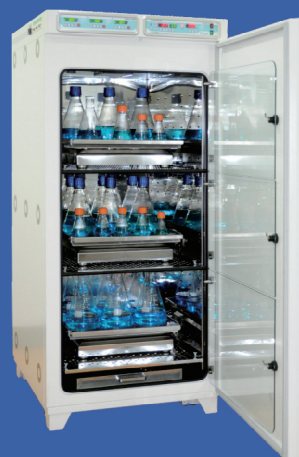
Inner doors Open