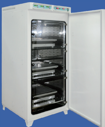
Outer door Open